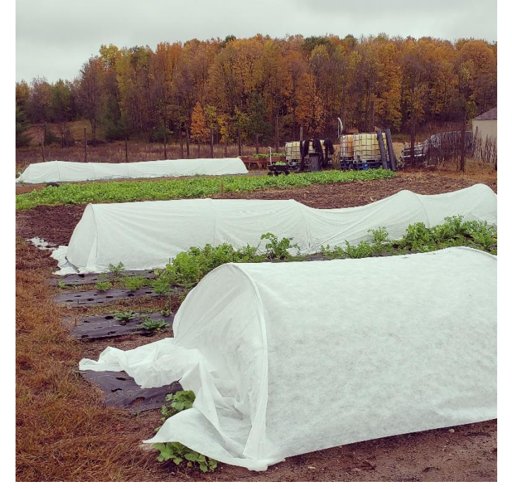
Low tunnels in a fall garden