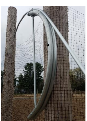
Bending EMT posts into hoops with the Hoop Bender